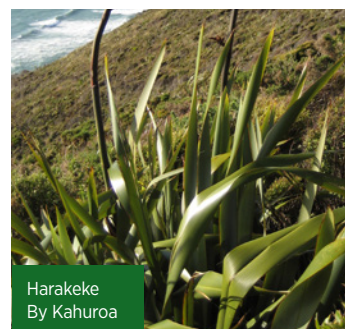
Harakeke By Kahuroa