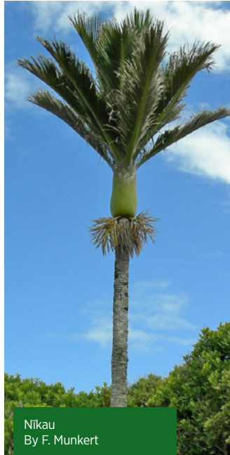
Nīkau