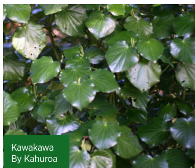
Kawakawa By Kahuroa