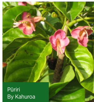
Pūriri By Kahuroa