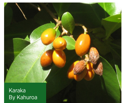
Karaka By Kahuroa

ANSWERS Across: 1. Pōnga, 2. Karaka, 3. Harakeke, 4. Harakeke, 5. Nīkau, 6. Kauri, 9. Kawakawa, 10. Rewarewa Down: 1. Pōnga, 2. Karaka, 3. Harakeke, 4. Harakeke, 5. Nīkau, 6. Kauri, 7. Mānuka, 8. Pūriri