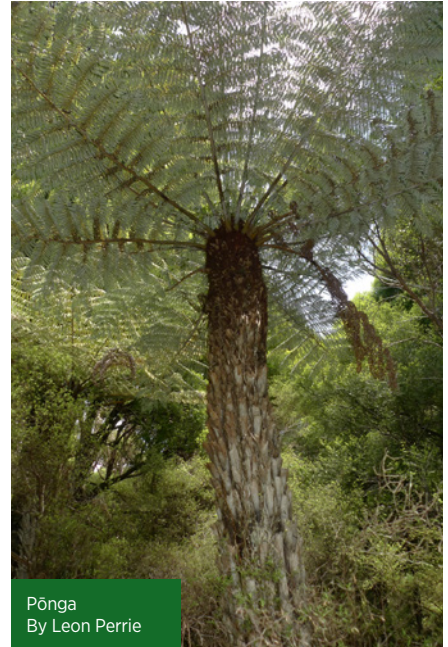
Pōnga By Leon Perrie