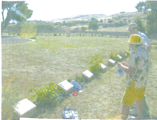
A view across the cemetery.