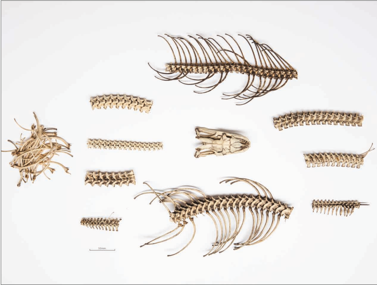
Figure 3. Surviving bones from the skeleton of a 3.8 m python (LH644) that De Kempeneer mounted for display at Auckland Museum in 1882. It was assembled originally in a sinuous shape, the snake viewed dorsally but elevated (tilted 90 degrees) onto a vertical black board.