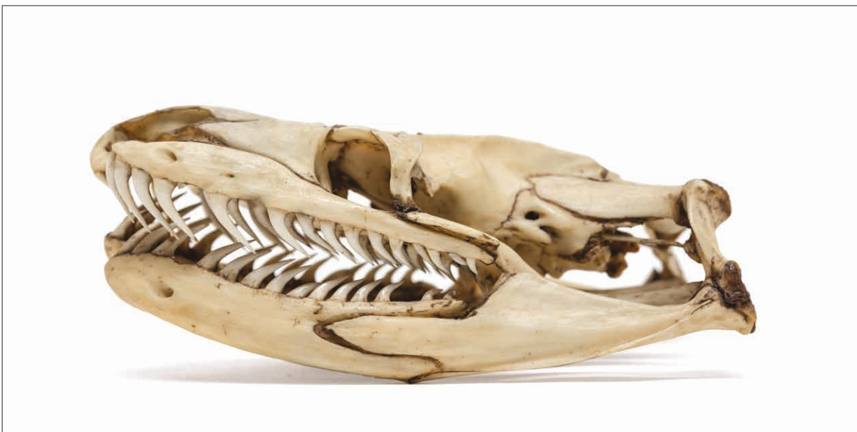
Figure 4. Skull of the python (LH644) that De Kempeneer prepared.