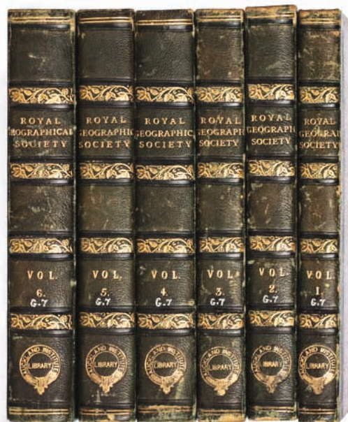
Figure 2. Binding of the journal of the Royal Geographic Society of London. G7 JOU.

I may tell you that up to now my Agent has procured for me 71 volumes referring to the History of New Zealand but there are many more required before I will be satisfied – by the way, it has occurred to me that you might have let me know what books you already possess on this subject, when I declared to you my intention of going into this matter as I may be taking much unnecessary trouble & spending more money than I need to. (18 May 1881)