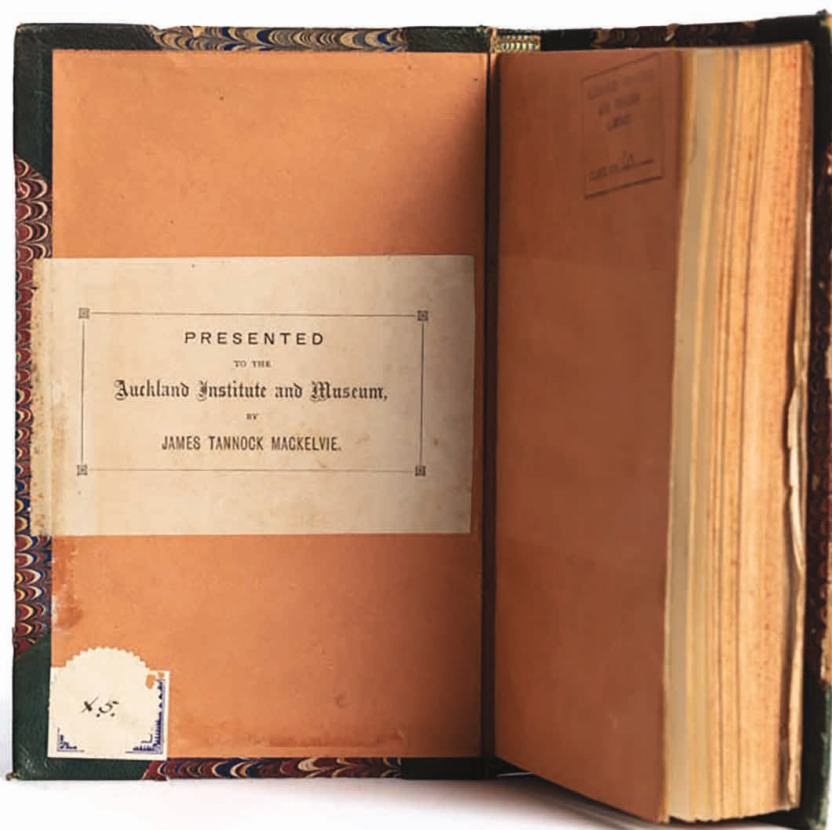
Figure 3. Donor plate in the journal of the Royal Geographic Society of London.